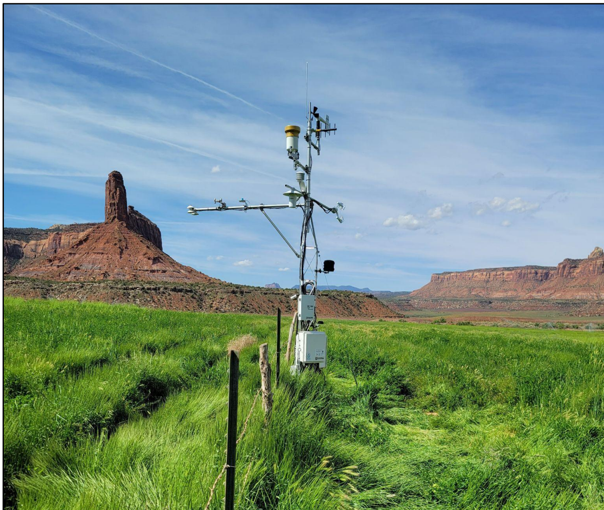
Figure 1. EC tower installed at Dugout Ranch, part of the Canyonlands Research Center