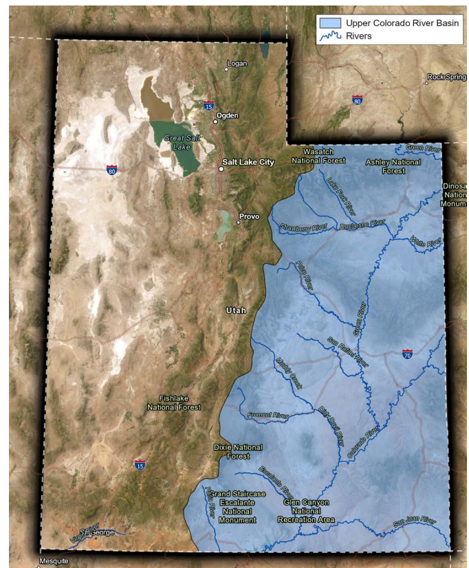
Figure 1. Utah Portion of the Upper Colorado River System